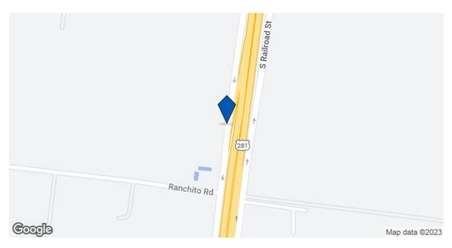
MAP OF 2032 S US HIGHWAY 281 FALFURRIAS, TX 78355